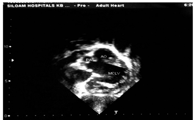
Figure 2. Double Outlet Left Ventricle