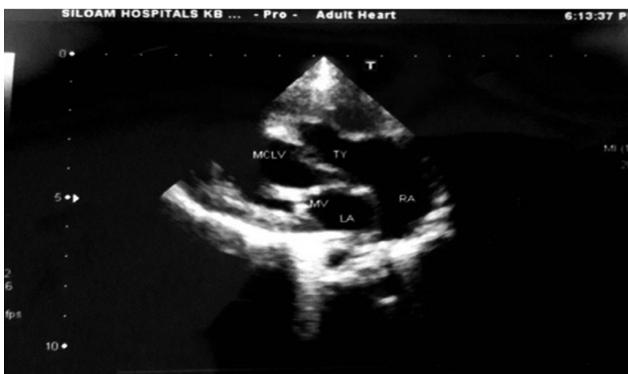
Figure 1. Double Inlet Left Ventricle

inlet of pulmonary artery procedure called Pulmonary Artery (PA) banding. During surgery, we found that the PA diameter is two times bigger than the aorta, PDA size was 3mm. The PA banding was done without any complication. Post PA banding, his blood pressure was 88/40 (52) mmHg with heart rate of 140 beats per minute and SpO 2 of 80-85%. Distal PA banding pressure was 29-30/16-18 mmHg. PDA was also ligated on this surgery. Then, patient transferred to Pediatric ICU (PICU) for post operation care. On third post operation day, the patient was stable hence transferred to the general ward. He was discharged on sixth post operation day. On three months after surgery follow up, PA banding showed good evaluation with pressure gradient of 68 mmHg ( Figure 3 ). He was scheduled to undergo bidirectional Glenn shunt procedure one year later and Fontan procedure a year after bidirectional Glenn shunt procedure.